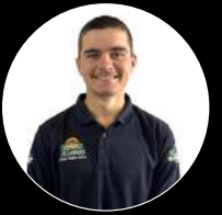
Installations Lliam Logan-McCallum