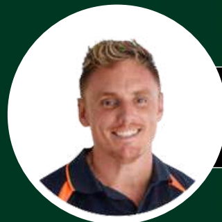
STIX FELLOWS Director