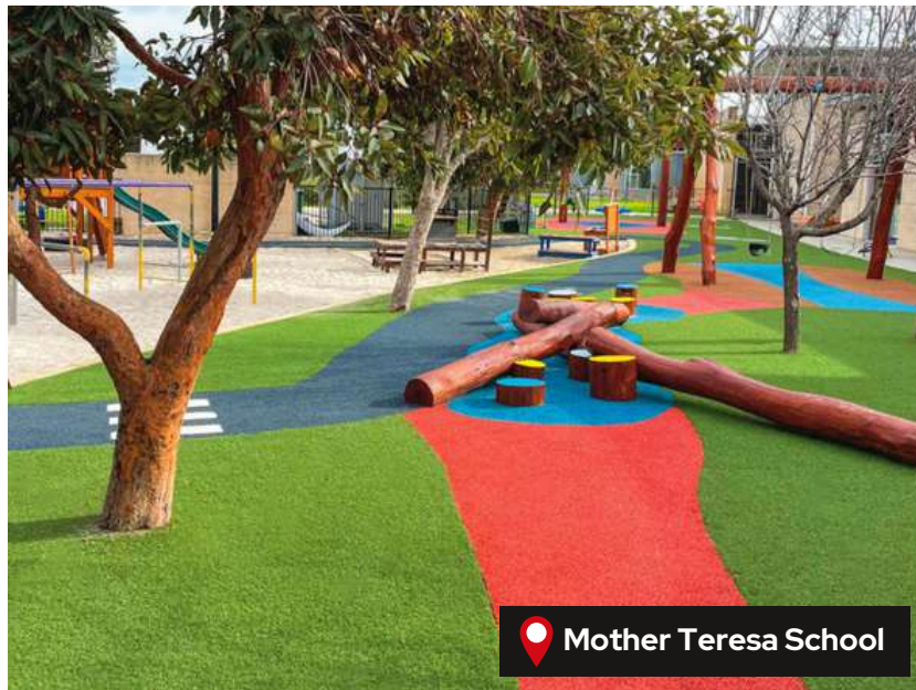
Mother Teresa School