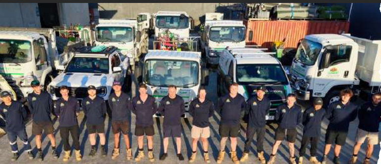
PORT KENNEDY, WA