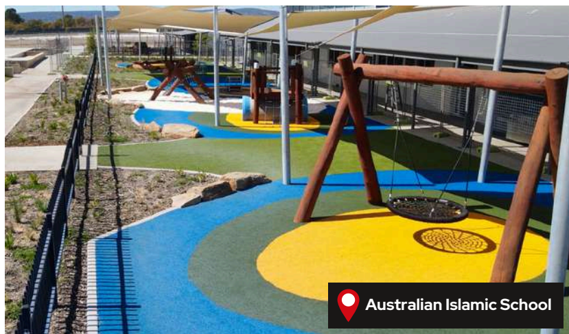
Australian Islamic School